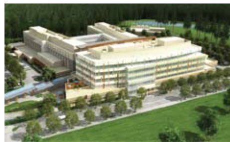
Swedish/Issaquah rendering provided by CollinsWoerman

IN ISSAQUAH: To meet the needs of the fast growing community of greater