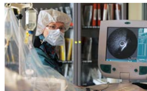
Swedish physicians provide advanced cardiovascular care to patients, from prevention and diagnosis to treatment and rehabilitation.