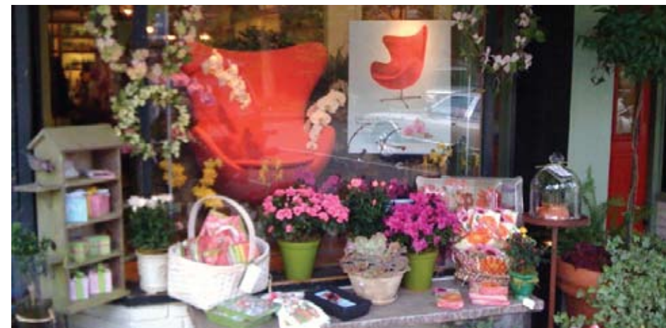
The Pink Chair Campaign was designed to raise awareness of the True Family Women's Cancer Center. Chairs can be found at each of Swedish's campuses, as well as in several area businesses, theaters and museums, including the Martha E. Harris Boutique in Seattle's Madison Park neighborhood.

Slated to open in early 2012, the 24,000 square-foot facility will be located on the second floor of the 1101 Madison building. It will be part of the renowned