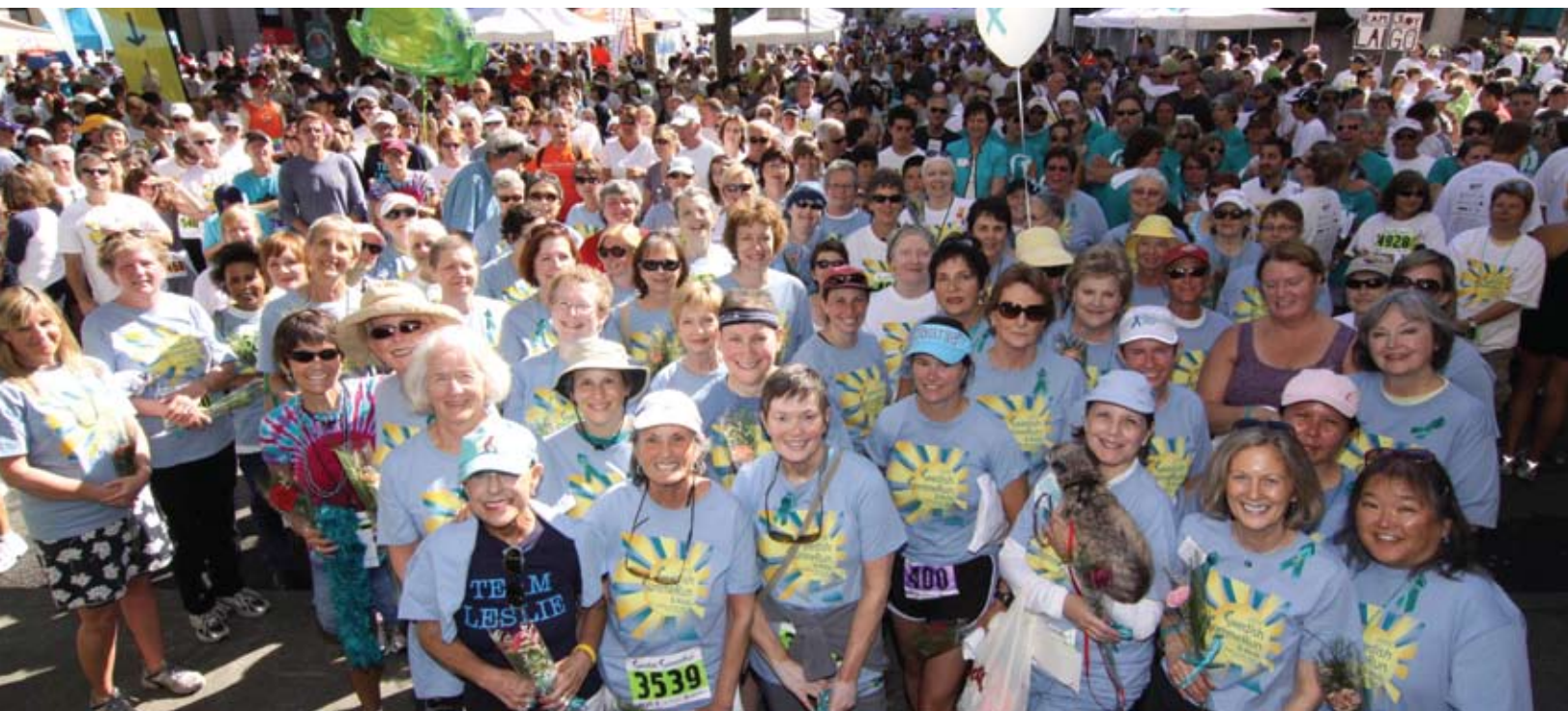
Ovarian cancer patients, survivors, and supporters enjoy the festivities at the 2010 Swedish SummeRun.