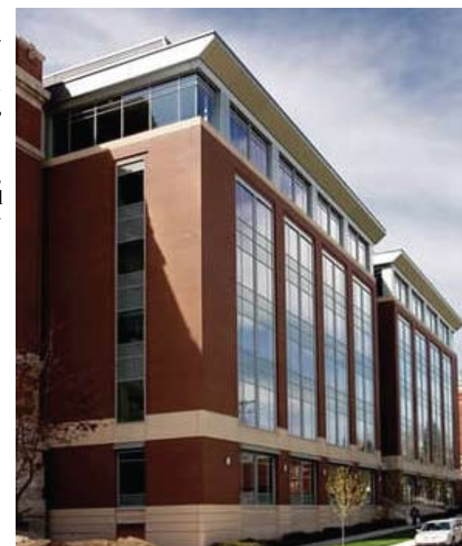
The Swedish Neuroscience Institute, established in 2004, has become a recognized world-class center for neurological health.

When the current neuro ICU is full, patients are typically cared for in the cardiac ICU, Dr. Newell explains. It is a workable solution, but not an optimal one. Through the help of philanthropy, Swedish is planning to build an expanded neuro ICU to provide constant monitoring and rapid response for post-surgical and stroke patients and those with brain hemorrhages, aneurysms, spinal cord injuries and head traumas.