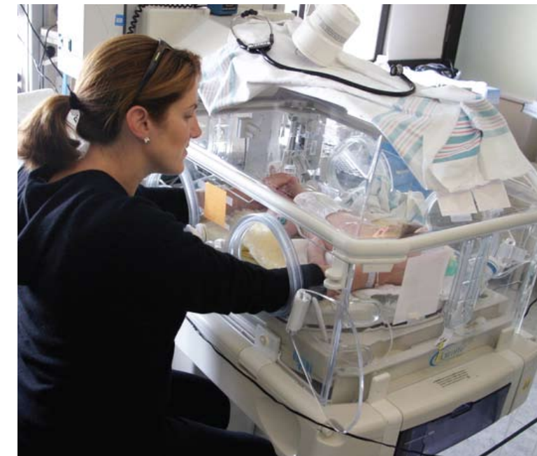
The new Neonatal Intensive Care Unit, which opened in September, allows Swedish to provide the best care possible to all babies in need.

"This simply could not have happened without the support of the community and the donors who made it possible," Gould says. "This is not just a hospital achievement, it's a community that has come together to create something very special and much needed. We're all just so grateful to have this dream become a reality."